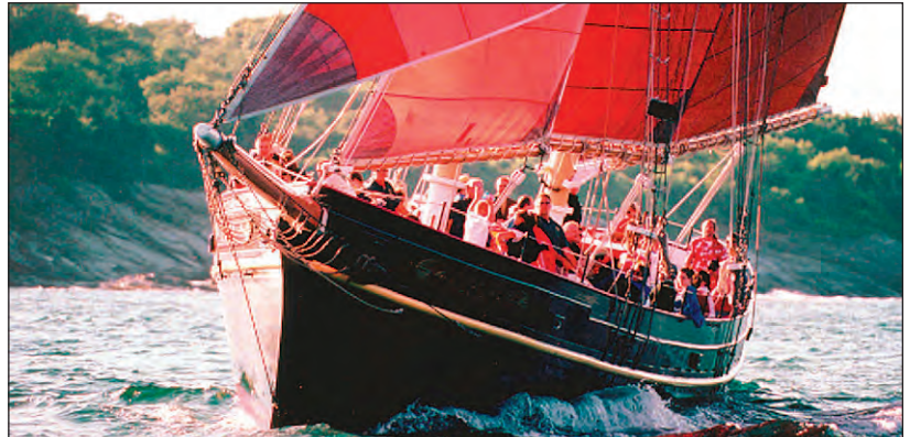
The distinctive schooner Aurora under sail in lower Narragansett Bay. What could be better than a lobster dinner followed by a sail under her red canvas?

Finally it was time for the long-anticipated boat boarding. We walked up the gangplank onto the majestic 101-foot schooner, which can accommodate up to 80 passengers, and is 68 years young. The